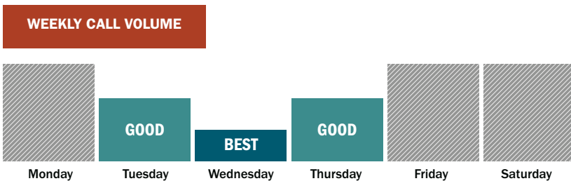
Mid-week calls have a quicker response.

We know your time is precious and we strive for great customer service. We want to help answer your questions as quickly as possible and with minimal wait time. Please see below the best times and days to call our support center.